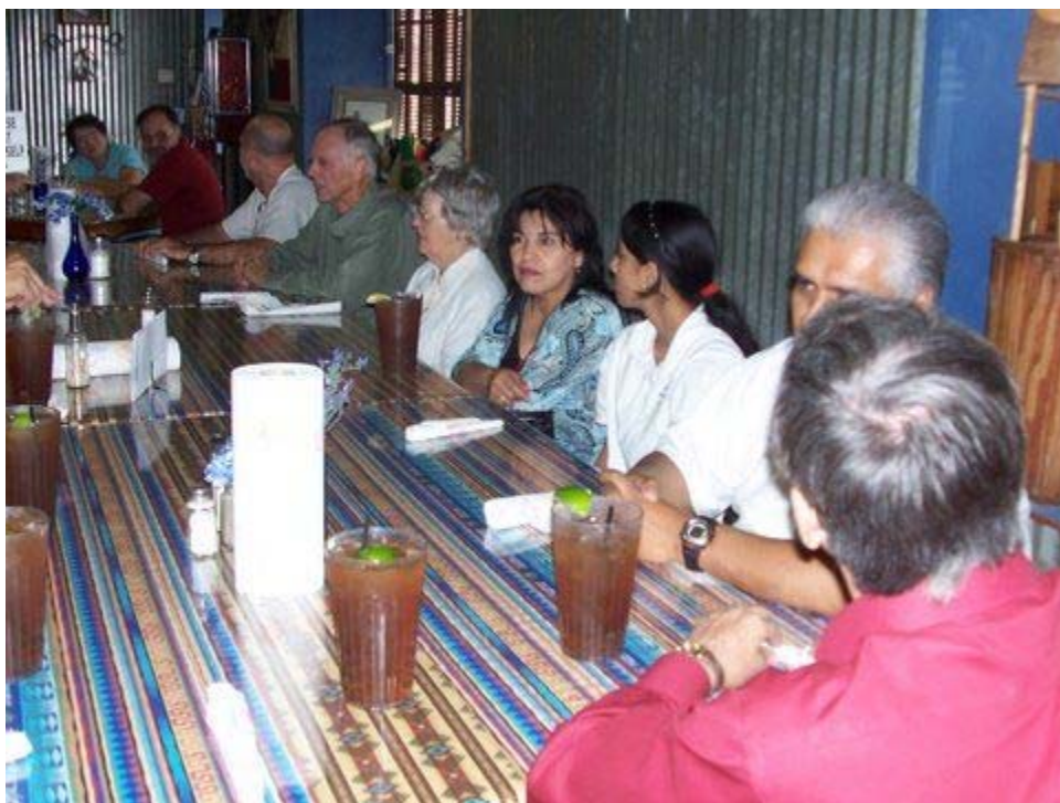
Lunch with MCCS guests after worship

AMEN to La Feria UMC who hosted faculty and a student from MCCS, the deaf school in Rio Bravo, which they support with supplies, scholarships, presents, and money to help the budget of the school. The director of the school gave the sermon.