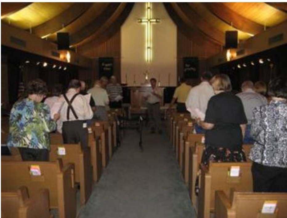
Wesley UMC sanctuary

AMEN to Wesley UMC for providing note cards in their foyer for sending "Thinking of You" cards.