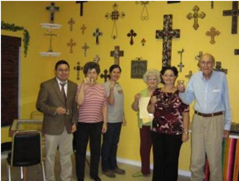
Donna FUMC Cristo el Rey Café wall of crosses

AMEN to Donna FUMC for working at becoming more welcoming by remodeling their coffee room. It is now called Cristo el Rey Café and has a Valley flair with a wall with crosses from the congregational families in honor of their 100 th year of ministry in Donna.