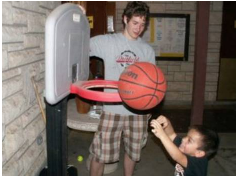
Parents Night Out at Mercedes FUMC